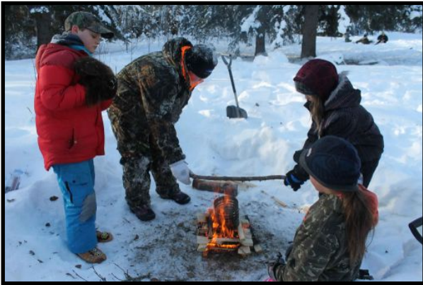
PALOOZA BOILING CHALLENGE