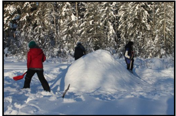
BUILDING A QUINZHEE