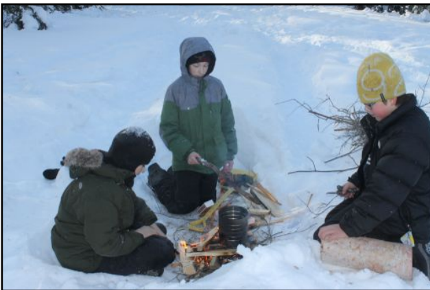
PALOOZA BOILING CHALLENGE